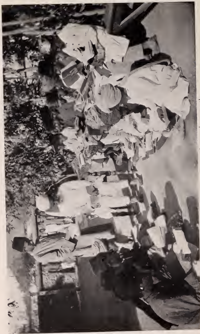
Teaching the Koran to the native youth